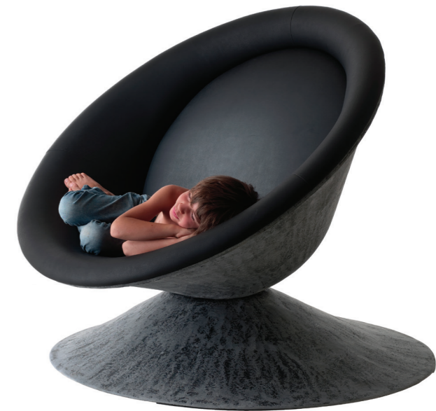
Epoche fibreglass armchair, upholstered cushion in leather or leatherette design verter turroni

Imperfetto Lab beautifies the idea of artfully constructing our visual world.