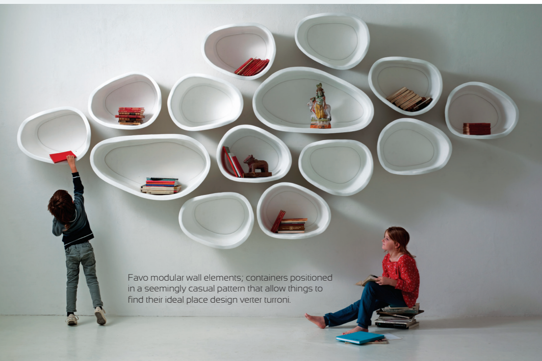
Favo modular wall elements; containers positioned in a seemingly casual pattern that allow things to find their ideal place design verter turroni.