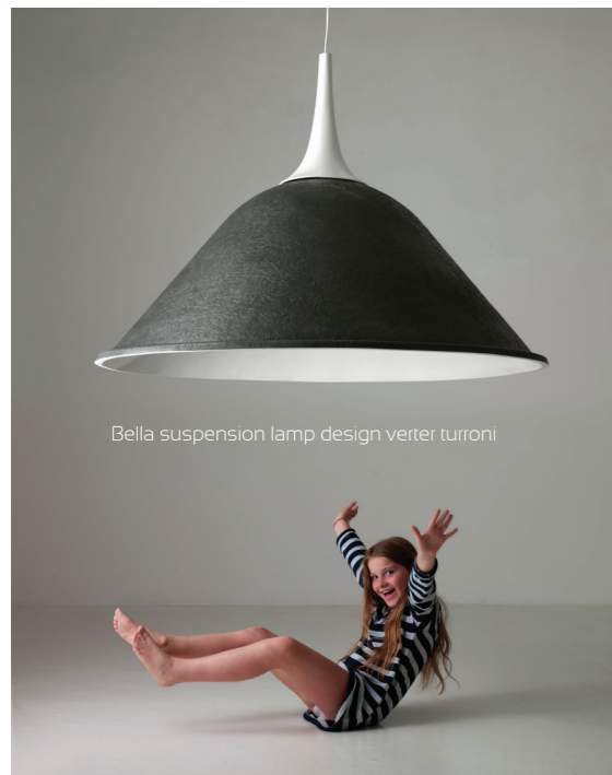
Bella suspension lamp design verter turroni