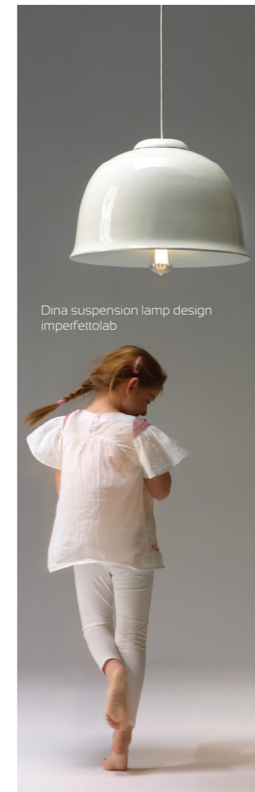
Dina suspension lamp design imperfettolab