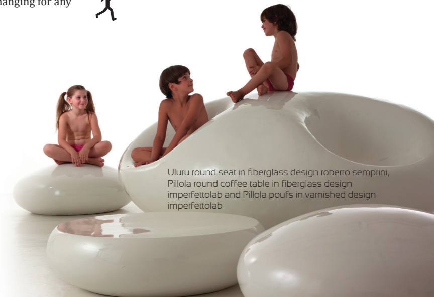
Uluru round seat in fibreglass design roberto semprini, Pillola round coffee table in fibreglass design imperfettolab and Pillola poufs in varnished design imperfettolab