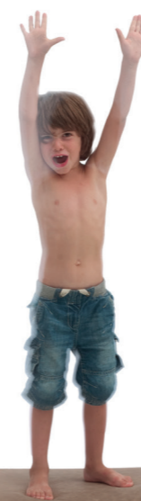
Triip sculptural handmade bench in fibreglass; stainless steel base, seat upholstered in sky leather design verter turroni