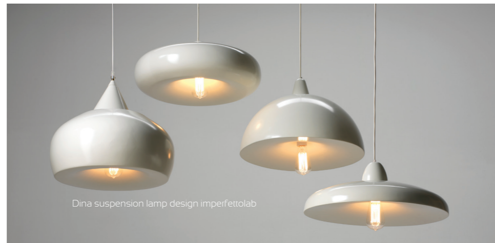
Dina suspension lamp design imperfettolab

"Each piece is made from a common mould, which is then sanded, painted and hand-polished. The working process differs for each type of object, thus becoming unique in its genre. Thanks to such a personalized approach to items, they acquire identity and uniqueness, as well as showing exceptional attention to details that derives from an expert and skillful craftsmanship," it said on the company's website. "The names given to each item recall the world of nature, such as Bulbi (bulbs), Gusci (shells), Ciottoli (pebbles); shapes and