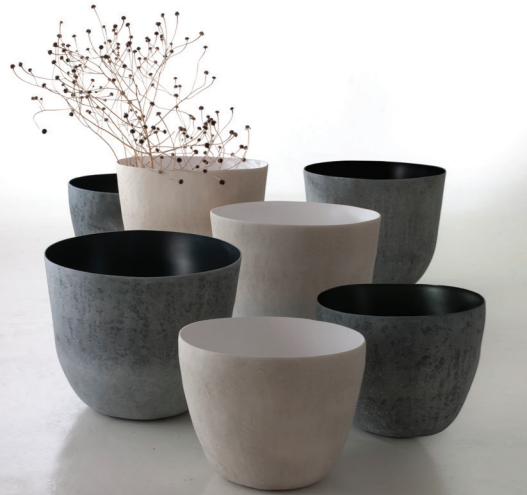
Vaso fibreglass vase design imperfettolab