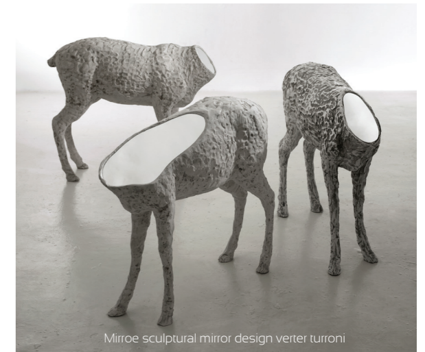
Mirroe sculptural mirror design verter turroni