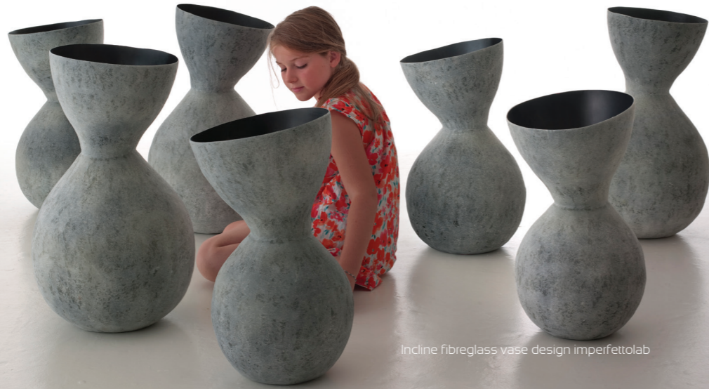
Incline fibreglass vase design imperfettolab