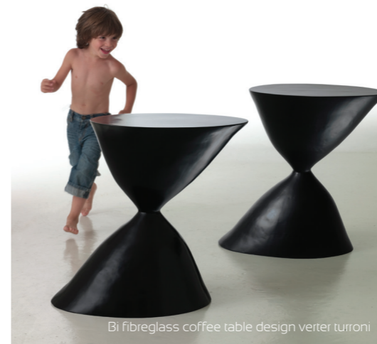
Bi fibreglass coffee table design verter turroni